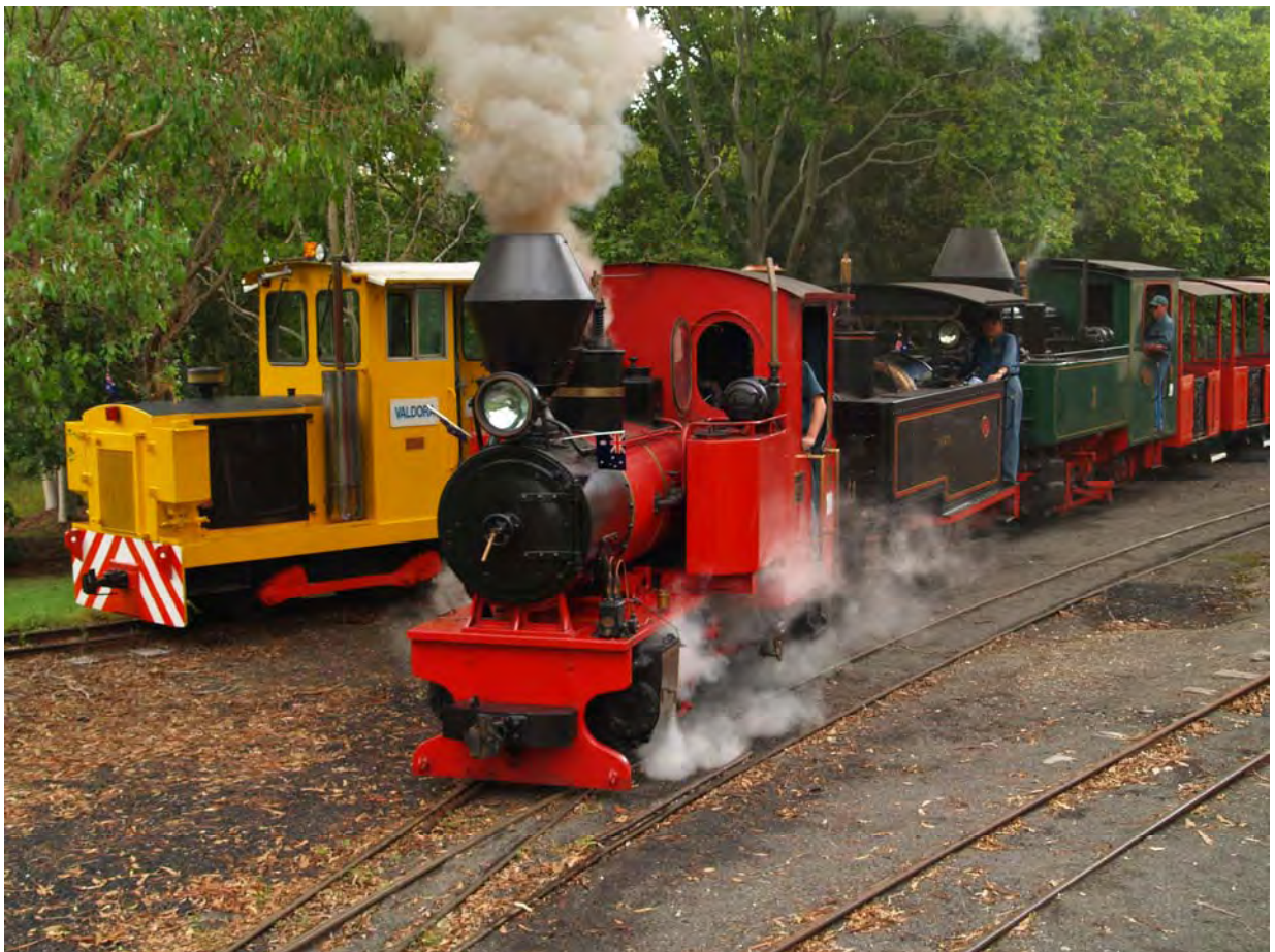
Triple heading on Australia Day 2009