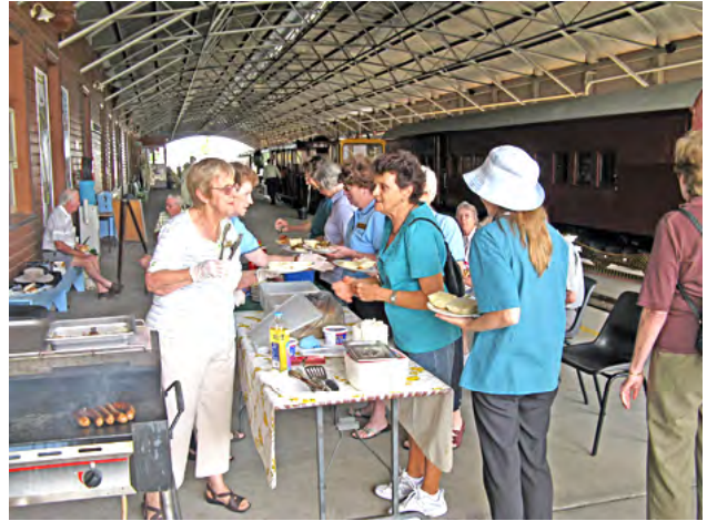
Lining up for a 'snag' under the Carriage Shade for a Carriage Shade Capers Sunday in 2010 [lz 6641]

The carriage shade is the full length curved roof over the platform and adjacent tracks. It protects passengers and trains from the tropical sun and eliminated the need to build a separate carriage shed. The opening at the top allows heat and locomotive/tram smoke to escape.