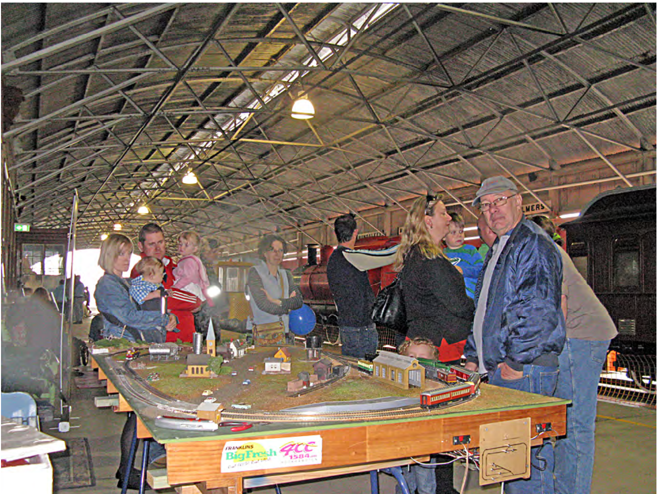
Under the Carriage Shade: Family fun and model railways during the June 2012 'Capers'. [lz 9631]