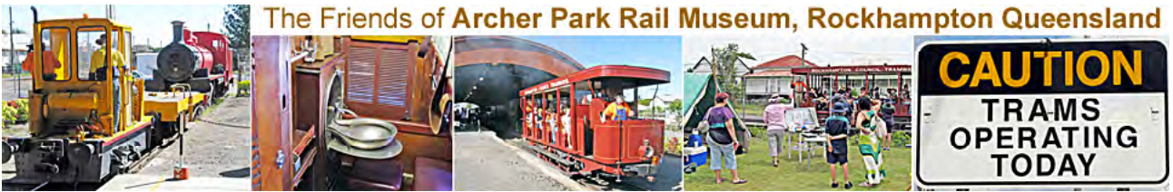
The Friends of Archer Park Rail Museum, Rockhampton Queensland