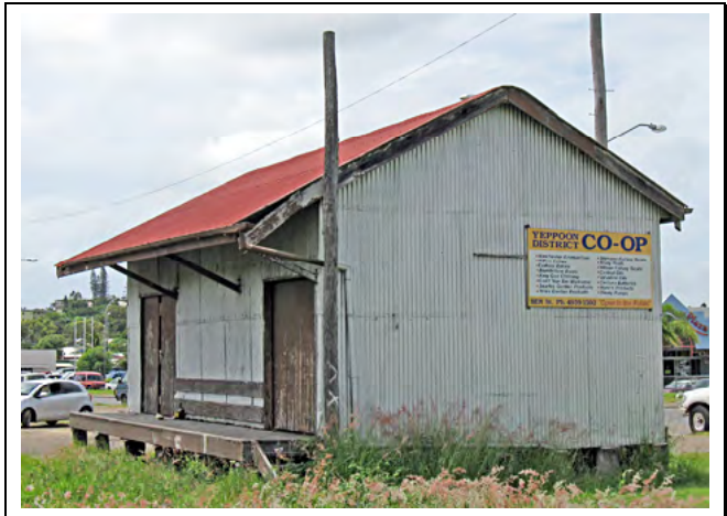
Freight shed in station precinct, Yeppoon [lz 1043]

closed several years earlier and the mine's traffic also failed after a few years.