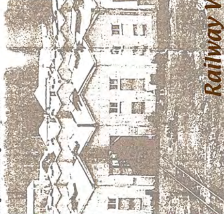
Image: Rocky's 860, Roundhouse/Railways of Australia Network, April-May/June 1995, p46-7