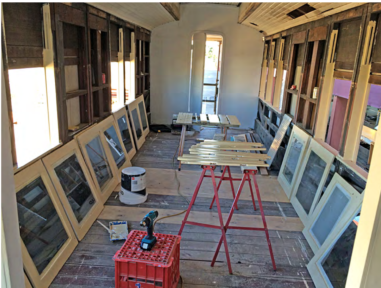
Work being done inside CM21 (above) and exterior views (next page).

We are happy to say school excursions are active again, with St Anthony's visiting last week and the Grammar School to visit in June, as well as a Gladstone and Mackay school to visit in July and August. Great to help the kids to learn about rail and steam!