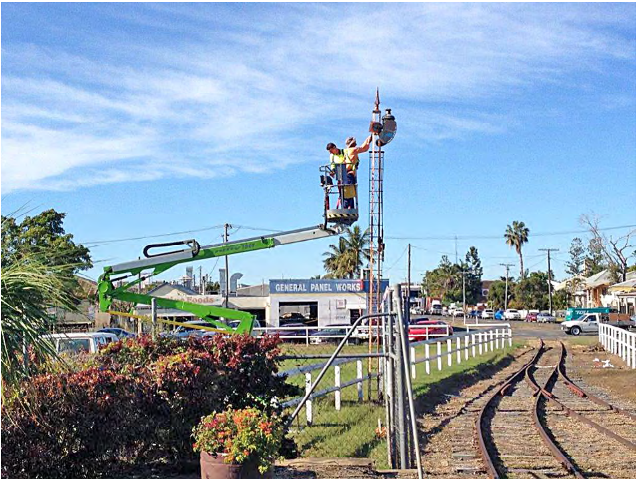
Signal arm being fixed following Cyclone Marcia damage.