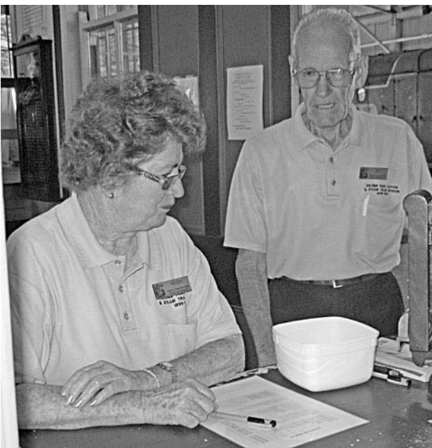
Above and left: Preparing for Carriage Shade Capers, 31 August 2008.