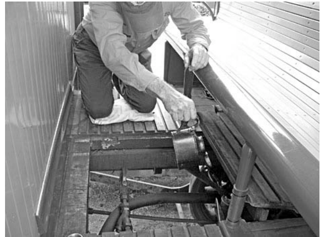
Above and left: Preparing the tram for operation, 31 August 2008. More Carriage Shade Capers photos on the last page.