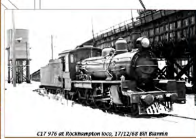
C17 976 at Rockhampton loco, 17/12/68 Bill Blannin