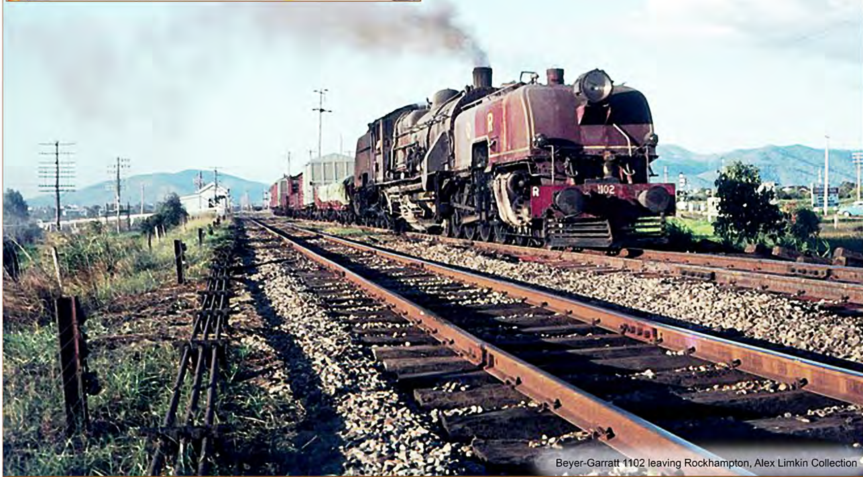
Beyer-Garratt 1102 leaving Rockhampton