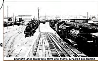
Loco line up at Rocky loco from Coal Stage, 17/12/68 Bill Blannin